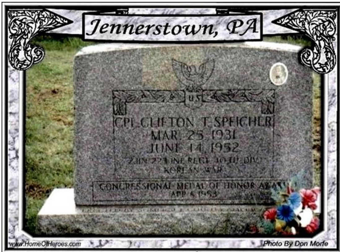
Beam German Reformed Cemetery Jenner Twp (1 mile north of Gray), Somerset Co, PA