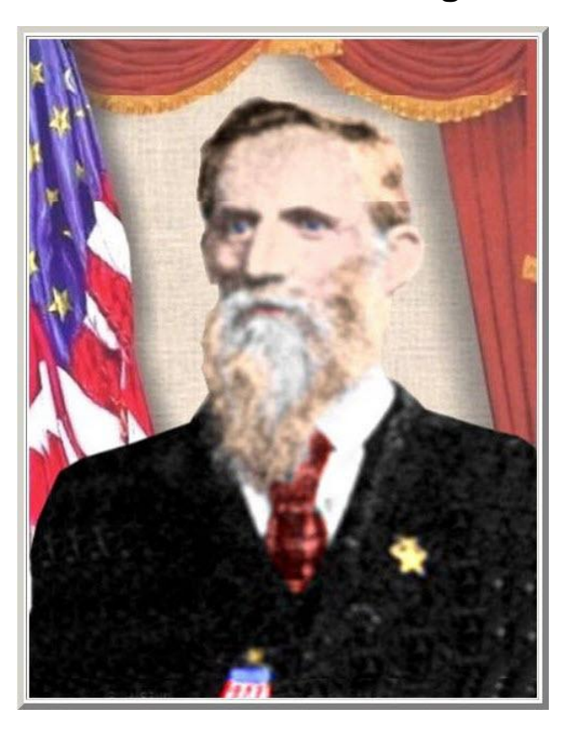
U.S. Army Medal of Honor, Civil War