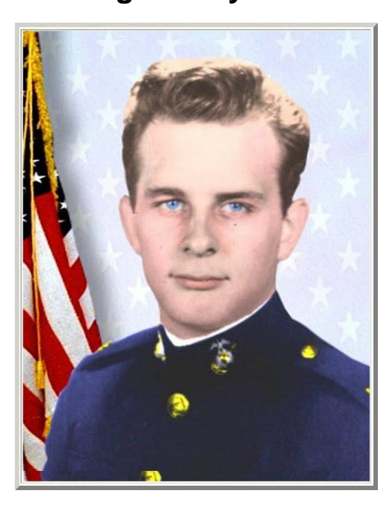
U.S. Marine Corps Medal of Honor, Korean War